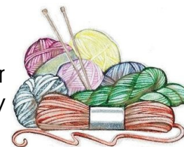
Prayer Shawl Ministry

Jesus is so good and so faithful, for you and for me, and it is our prayer that whatever you are going through, Jesus will abundantly remind you of His grace, peace, love and faithfulness.